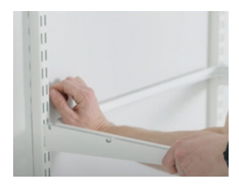
2. When aligned, press the gliding frame using your hand at the left rounded corner until you hear it lock into place..