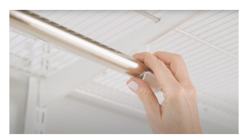
3. Mount the rod into the rod holders. First, snap joining rods into a closet rod holder and second, snap the outer end of each rod into the outer closet rod holders.