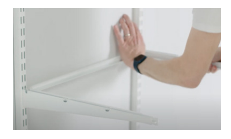
3. Repeat on the right side. Then "roll in" the frame with the mesh or wire basket.