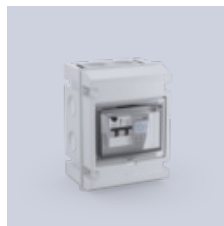
Mini electrical enclosure

Learn more about this product: https://www.ebeco.com/products/snow-melting-ground/snowmelt